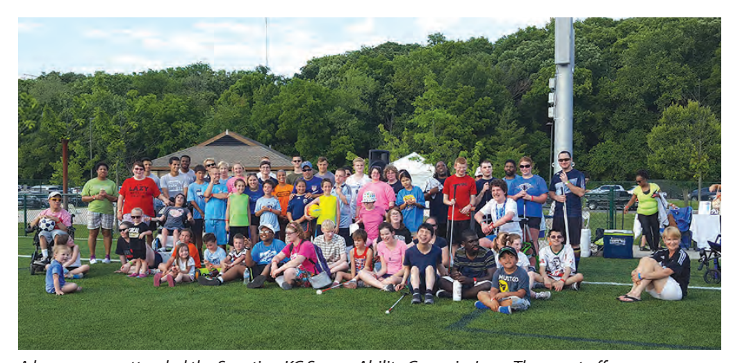
A large group attended the Sporting KC Soccer Ability Camp in June. The event offers an introductory skills development camp for people of all ages and ability levels, particularly persons with disabilities, including but not limited to developmental disabilities, physical disabilities/injuries and cognitive disabilities. The event is organized by the Recreation Council of Greater Kansas City (RCGKC). TWP was proud to support the event.