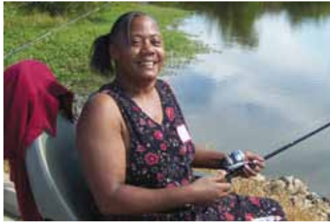
Consumer enjoying fishing at Cast 'N Blast!

But Cast 'N Blast is not the only event that TWP's volunteers contribute to. In 2011, over 45 volunteers contributed nearly 1,600 hours of service to TWP, equaling a value of $28,727. Volunteers help expand services, offset financial limitations, serve as morale boosters and allow staff to attend to daily responsibilities. And because nearly 75% of TWP's volunteers have a disability, these volunteers enhance TWP's presence in the community, becoming advocates and ambassadors for independent living.