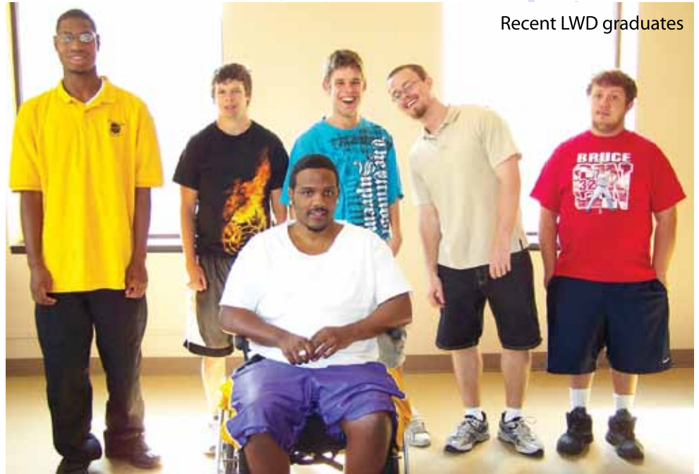
Recent LWD graduates