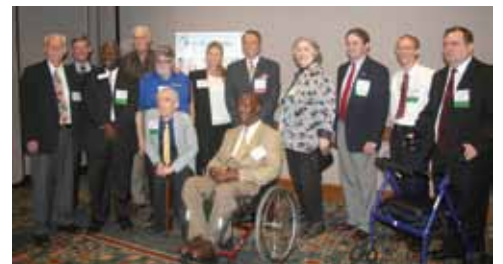
The Whole Person Board of Directors with honored guests.