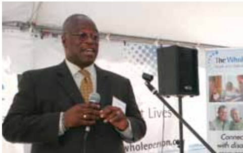
Mayor Sly James spoke about the new facility's contribution to Kansas City.