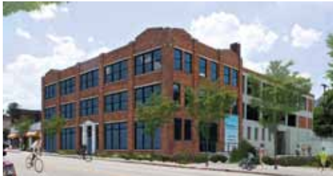
Artist's rendering of new TWP building.