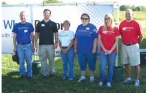
Staff from Assurant Employee Benefits and Walgreens volunteered at the event.