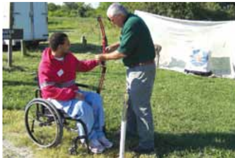
Consumers enjoyed archery and air rifle target shooting.