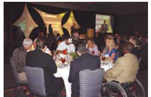
Over 270 guests attended the luncheon.