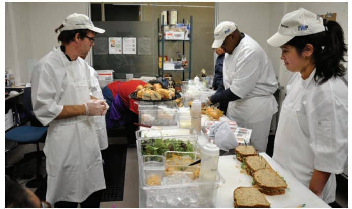
Students receive hands on training in the catering kitchen at The Whole Person.

such as organization, self-advocacy, effective communication, and problem solving. Participants then moved on to Stage Two, where they will spend five weeks in TWP's Catering Kitchen. Participants are learning how to read recipes and create menu items, as well as prepare individual and catering orders for sandwich and dessert platters. They are also learning food safety and sanitation guidelines necessary to work in a kitchen. Participants receive weekly feedback and are working to create a portfolio showcasing all of their creations. Recently, participants learned how to weigh ingredients and use equipment such as a meat slicer and cheese grater. They are catching on quickly! In mid-November, participants will return to the classroom for Stage Three, where they