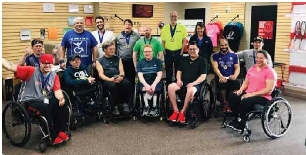
The Whole Person Kansas City No Coast Tennis Team participated in the annual Wheel It Forward Tennis Tournament.

In addition to competitive wheelchair tennis, TWP offers recreational tennis through the "All Abilities" program held on the 1st and 3rd Saturdays of each month from 11:00 am to 12:30 pm at the Northland Racquet Club. There is a $5/week fee, with scholarships available for those who qualify.