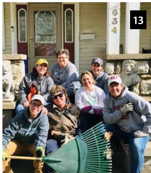
9. TWP Planting Independence sponsor Westlake Ace Hardware had several groups volunteer for the Spring 2019 event. 10. Employees of VMLY&R cleaned up a yard. 11. Crema had a group of volunteers for Planting Independence. 12. Employees from Davita came out to help with the Planting Independence event. 13. Members of the Girls That Like Bacon softball team enjoyed doing yard work for one of our consumers.